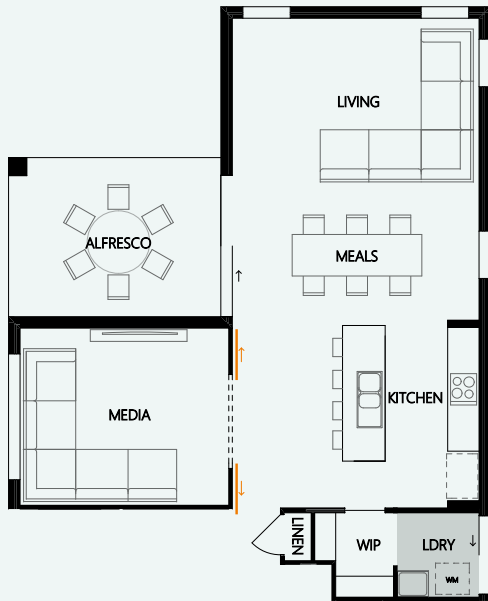
BARN DOORS TO MEDIA