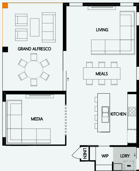
GRAND ALFRESCO UPGRADE

1.8m splashback window to kitchen option