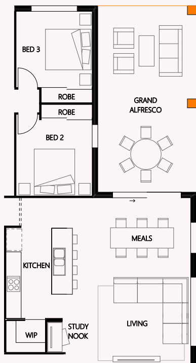
GRAND ALFRESCO Increase the alfresco by 16.8m 2