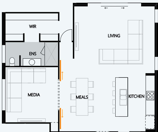
BARN DOORS TO MEDIA