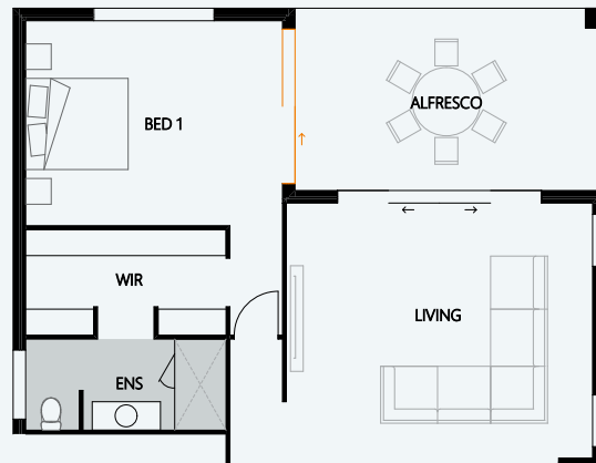
SLIDING DOOR TO BED 1 2.7m sliding door to bed 1